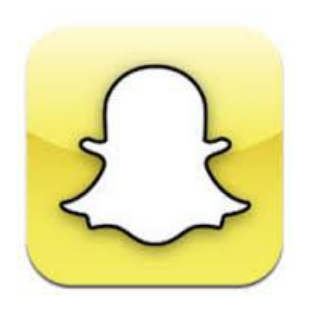
\underline{Snapchat} - 12 +