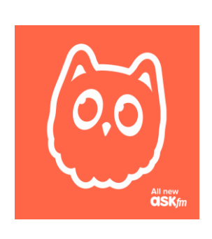
<u> Ask.fm </u> – 12+ –