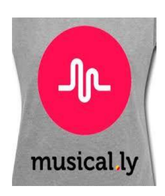
\underline{music.ly} - 12 +