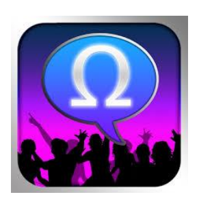
Omegle – 17+ - chatting with strangers