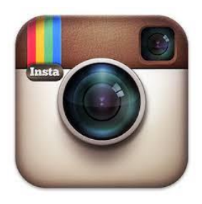
\underline{\textit{Instagram}} - 12 +