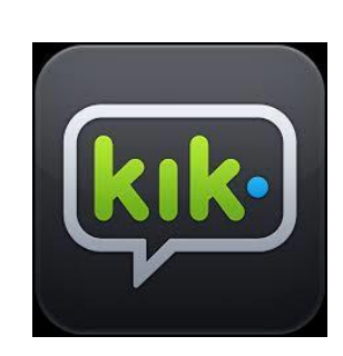
<u>kik</u> - 17+