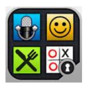
<u>Best Secret Folder</u> – hides photos but looks innocent as an accessories app