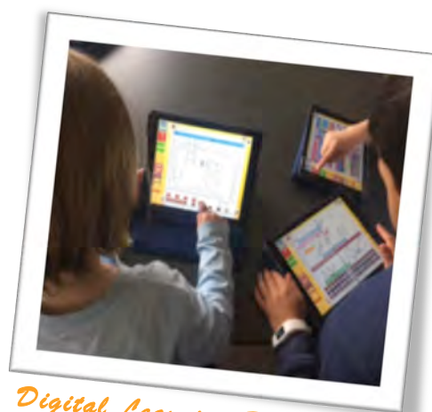
Digital Learning Technology