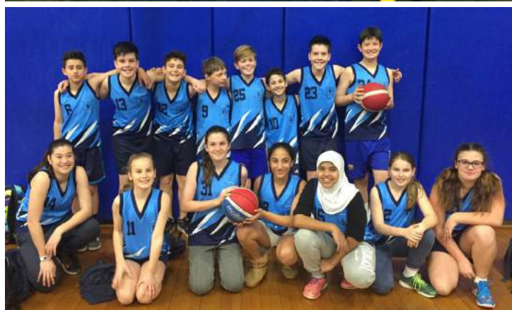
Grade 6 Basketball and Soccer Tournaments

Strategies for parents as referred to in the DET website: