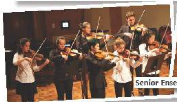
Senior Ensemble & Alumni