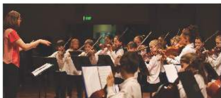
Grade 2 Strings